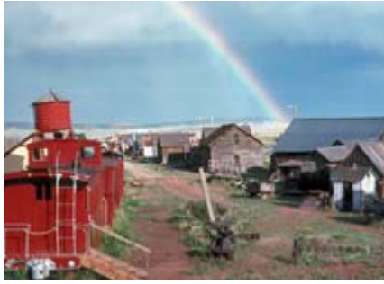
South Park City Museum in Fairplay